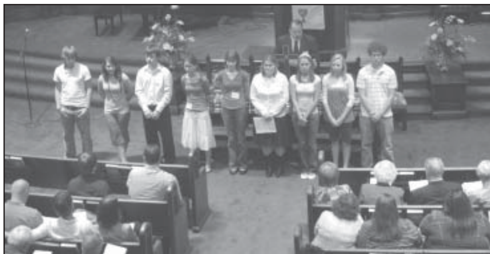
2007 - 2008 Youth Ministry Council was installed at the Area Assembly in May.