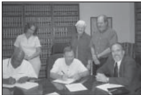
Western Heights Christian Church property given as a gift to the North Texas Area.

These last few weeks have been full of promises kept and blessings given. After more than a year of seeking a new (and church-related) home for the North Texas Area Office, we were given the building and grounds at 3525 Lawler Road from the Western Heights Christian congregation to use as a Mission Center and Area Office. The transfer of property took place Friday, July 13 in a ceremony at the office of the Southwest Region's attorney. This gift, by the remarkably generous and visionary membership of Western Heights, enables the Area to begin to 'hothouse' new church starts, to enjoy a permanent home, and to have a place from which groups can go out into the Metroplex to do mission. We will also enjoy the continuing presence of the Western Heights Christian congregation, as they will continue to use the facility while determining their long-range future. The movers will be coming on August 15, so we have already begun renovation of the four classrooms we are converting to offices and workrooms. Plan on dropping by after we move!