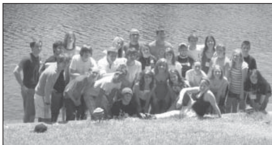
NTA Seniors pose for Senior Pix at CYF Conference