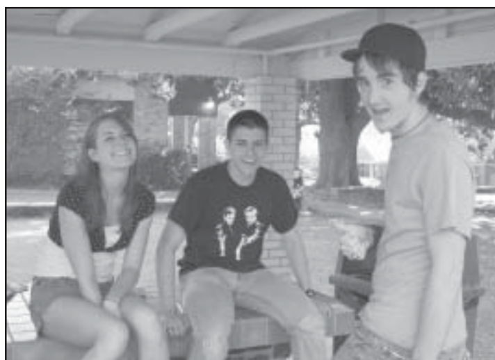
CYF'ers "hang out" at Conference