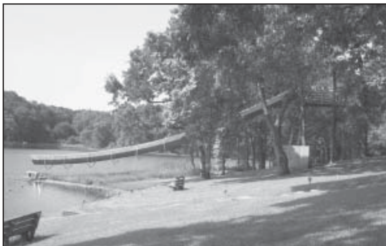
New water slide a big hit during camp!