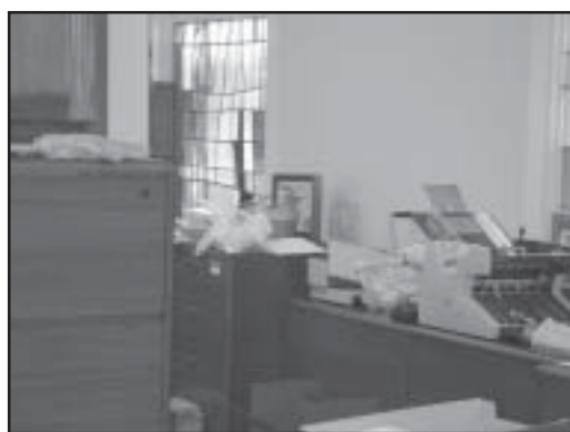
The workroom allows for easy access from Lyn's office.