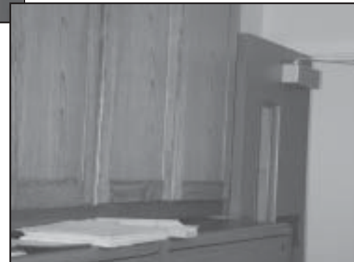
Built in cabinets increase our storage space above the file cabinets.